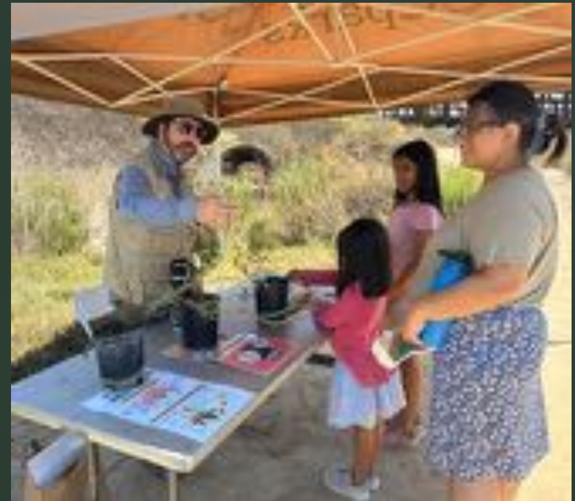
Nature Scavenger Hunt