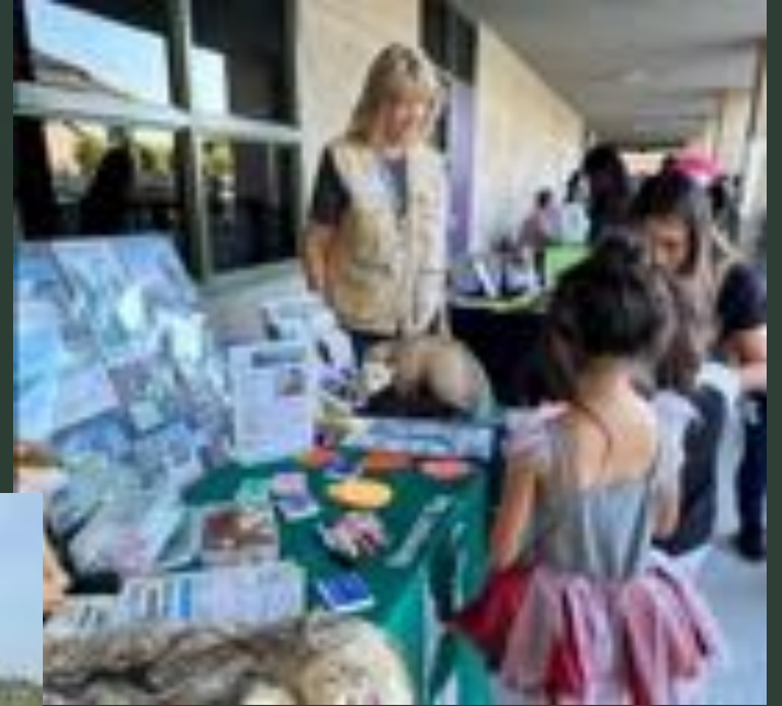
Heroes Elementary Fall Festival